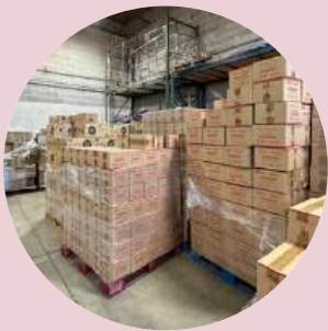
Caring through Co-Op