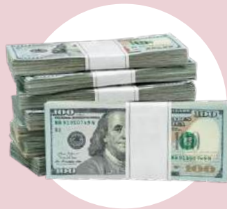
Chicago's Gemach Loan Fund Hits $5M