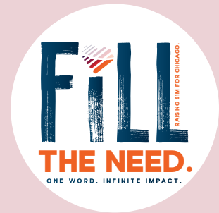
Rosh Hashana Campaign